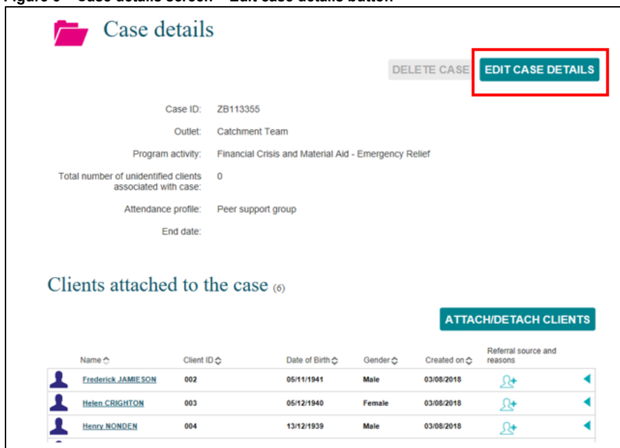
Figure 6 – Case details screen – Edit case details button

Once you have found and selected the hyperlink to the relevant case the Case details screen will display. Refer to Figure 6.